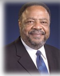
Sam Jones Former Mayor Mobile, AL