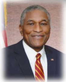
Johnny Ford Former Mayor Tuskegee, AL