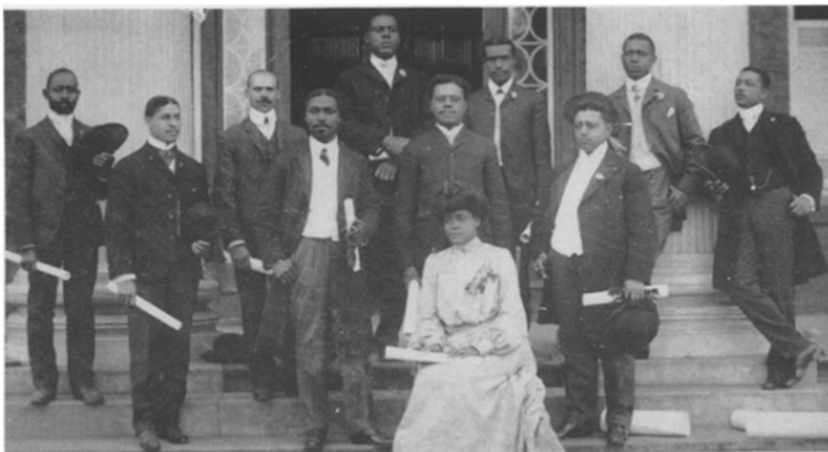
Several of Alabama's earliest Black doctors gathered in the early 1900s.